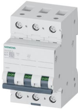
Miniature circuit breaker 400 V 6kA, 3-pole, B, 25A