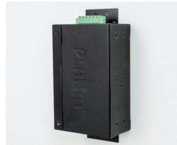
Side Wall Mounting (Space saving)